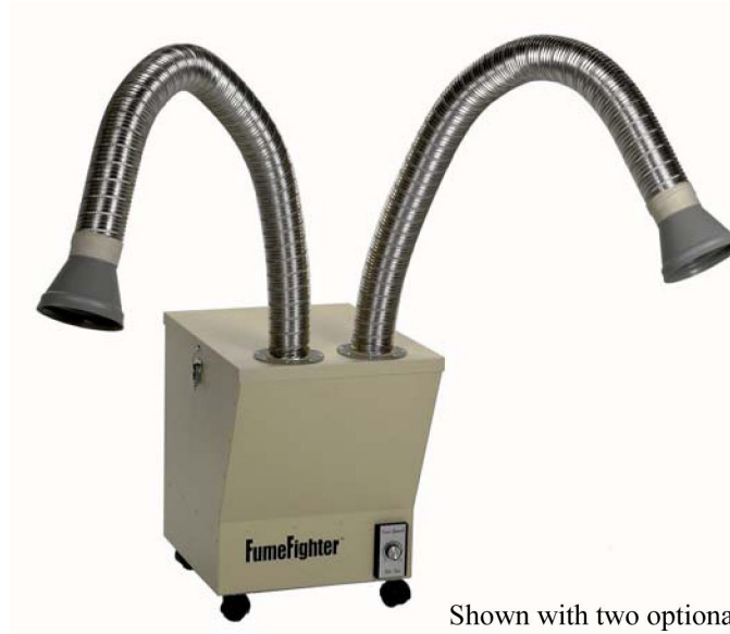
Shown with two optional arms